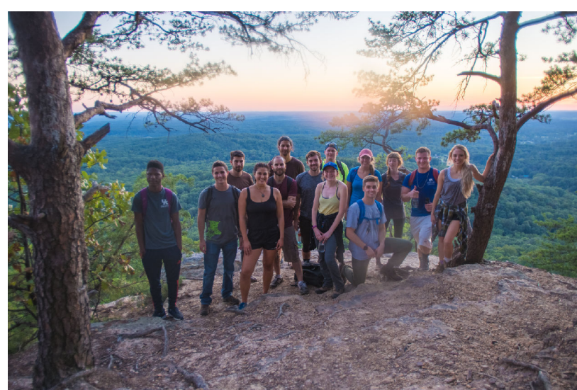
NRE 355, Fall 2016