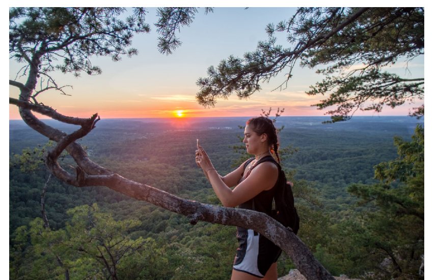
NRE 355, Fall 2016