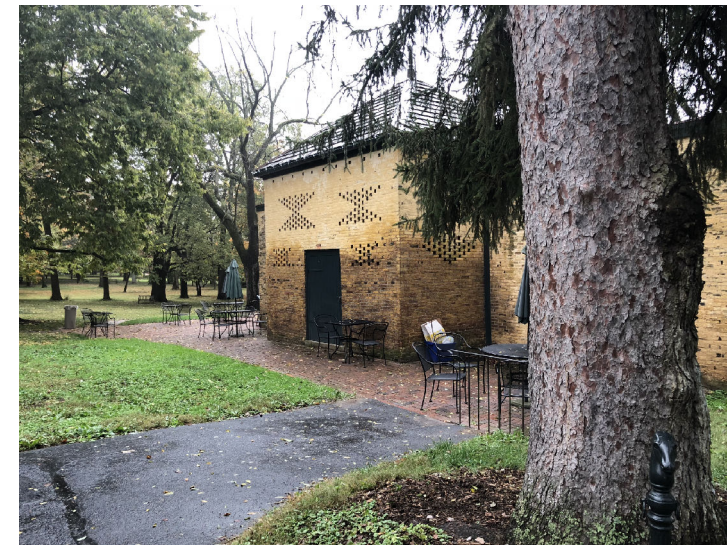
Ginko Tree Cafe